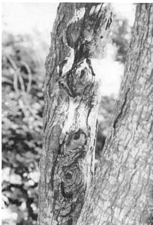
Fig. 1. Botryosphaeria canker on redbud ( Cercis canadensis L.).

PATHOGENS: Botryosphaeria cankers and dieback have been attributed to a number of Botryosphaeria species. The taxonomic distinctions between species are not universally accepted and problems with nomenclatural precedence are frequently noted in the literature (2,3,5,6). Species of Botryosphaeria (Class: Loculoascomycetes, Order: Dothideales) are most frequently encountered in their conidial or asexual stage. Conidia are produced in pycnidia in all cases, however, there is a good deal of variation (both within and between species) in the organization of the pycnidia (single or stromatic groups) and in the color, shape, and septation of the conidia (Fig. 2). As a result of this variation, anamorphs of Botryosphaeria are found in the form genera: Botryodiplodia , Diplodia , Dothiorella , Fusicoccum , Macrophoma , and Sphaeropsis (3,4,5,6). The nomenclatural status of these various form genera are also not totally agreed upon by all authors.